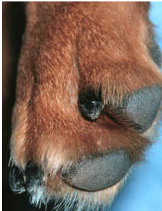
Correctly trimmed nail

Use of a grinder lessens the chance of “quicking” the puppy. Raisers may also want to look at diagrams online showing exactly how and where to make the cut when trimming a dog’s nails.